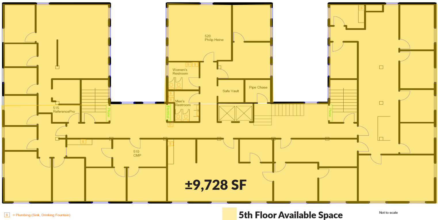
Hutton Floor 5

9 S. Washington Street, Spokane, WA 99201