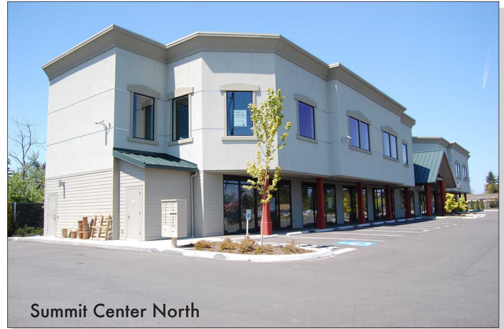
Summit Center North