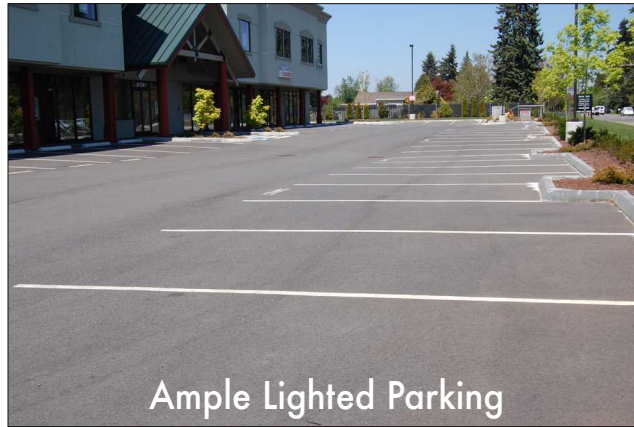
Ample Lighted Parking