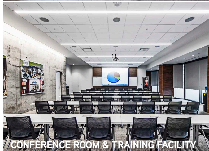
CONFERENCE ROOM & TRAINING FACILITY