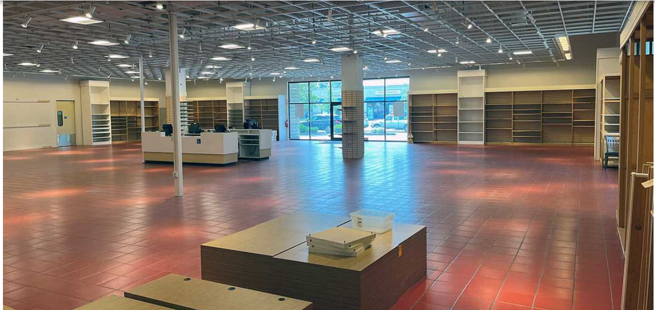
Interior Main Space | Showroom Floor