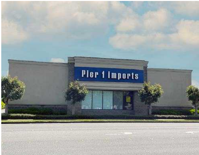
Additional Signage Available on Burlington Blvd.