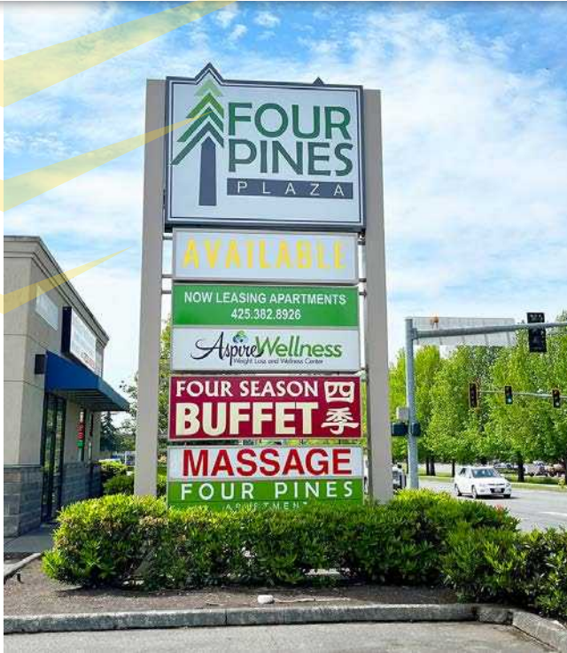
Available Monument Signage Along Burlington Blvd.

Four Pines Plaza 1220 S Burlington Boulevard, Burlington, WA