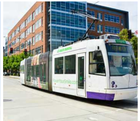
THE SLU STREETCAR