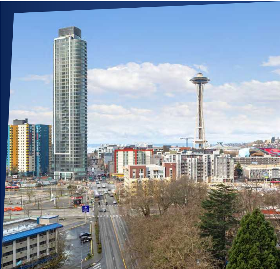
SPACE NEEDLE AND LAKE UNION VIEWS