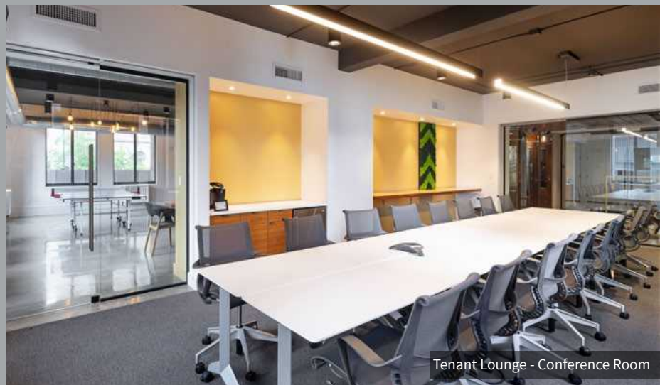
Tenant Lounge - Conference Room