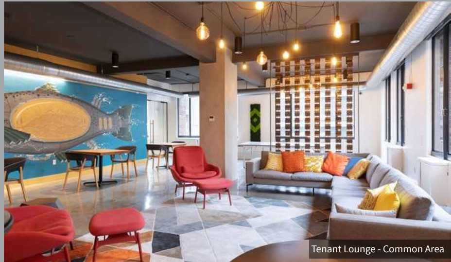
Tenant Lounge - Common Area