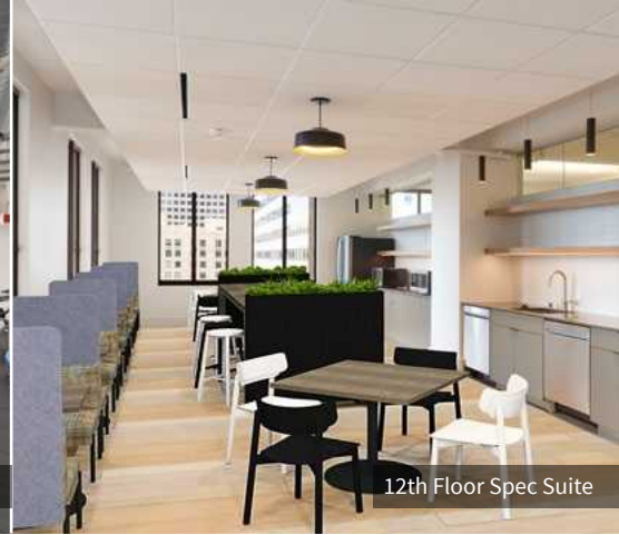
12th Floor Spec Suite