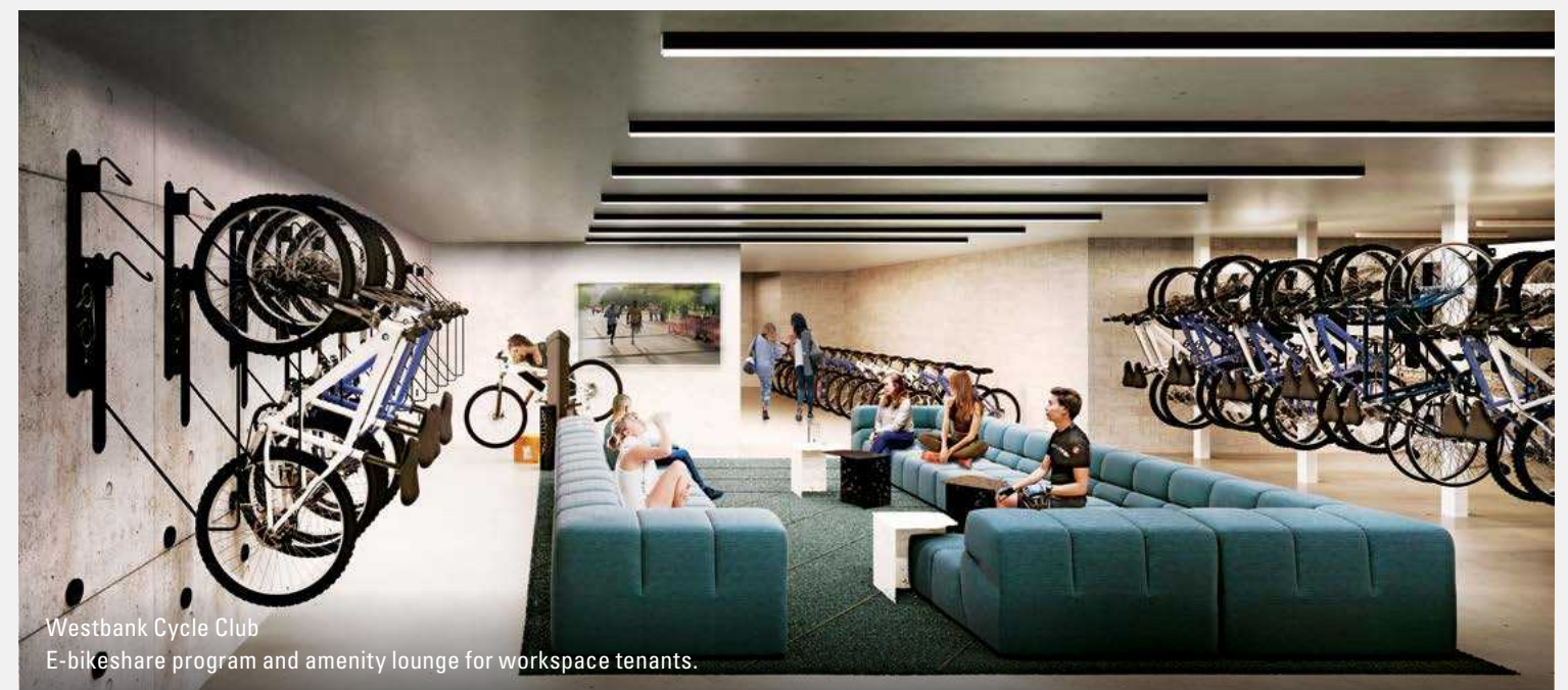
Westbank Cycle Club E-bikeshare program and amenity lounge for workspace tenants.