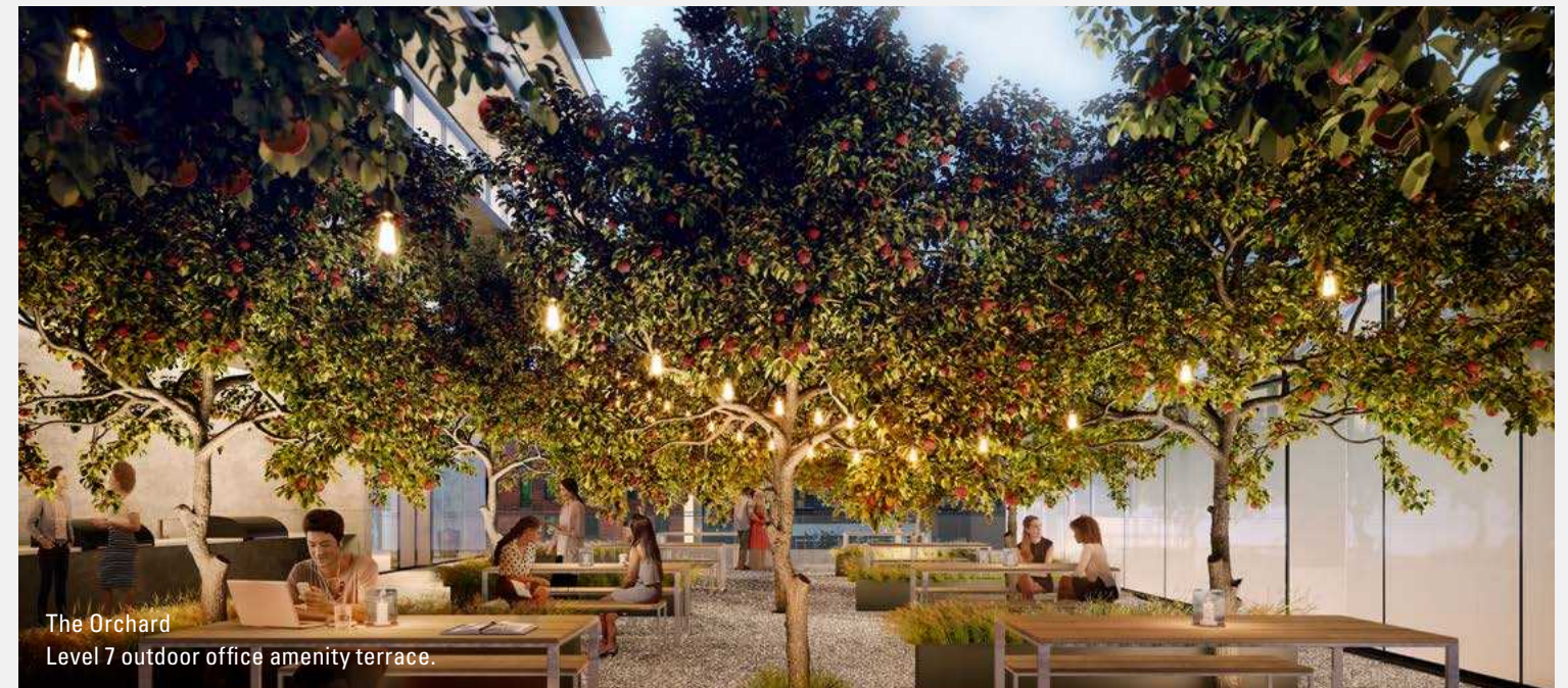
The Orchard Level 7 outdoor office amenity terrace.