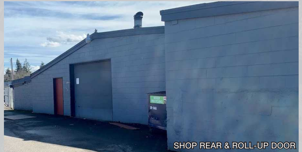
SHOP REAR & ROLL-UP DOOR