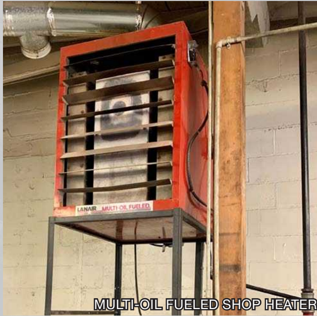
MULTI-OIL FUELED SHOP HEATER