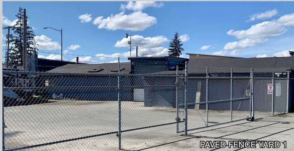
PAVED FENCE YARD 1