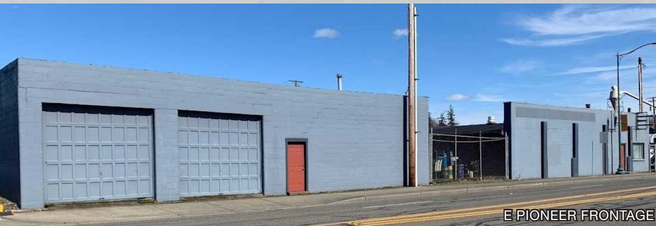
E PIONEER FRONTAGE