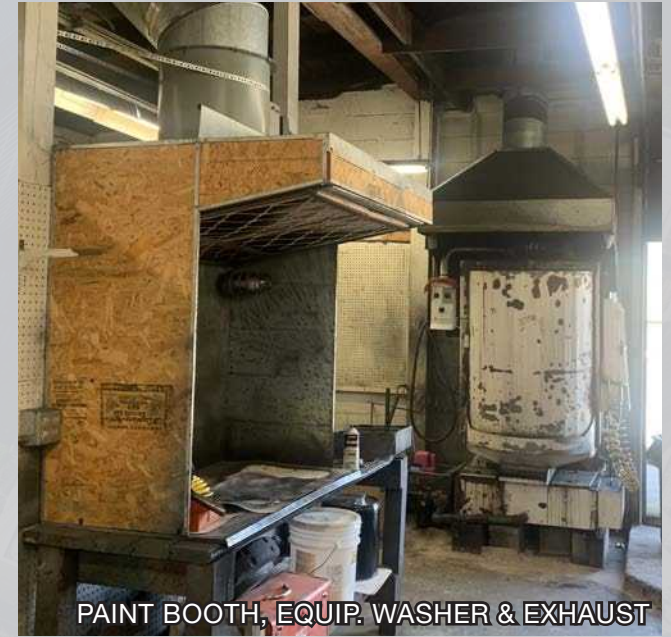
PAINT BOOTH, EQUIP. WASHER & EXHAUST