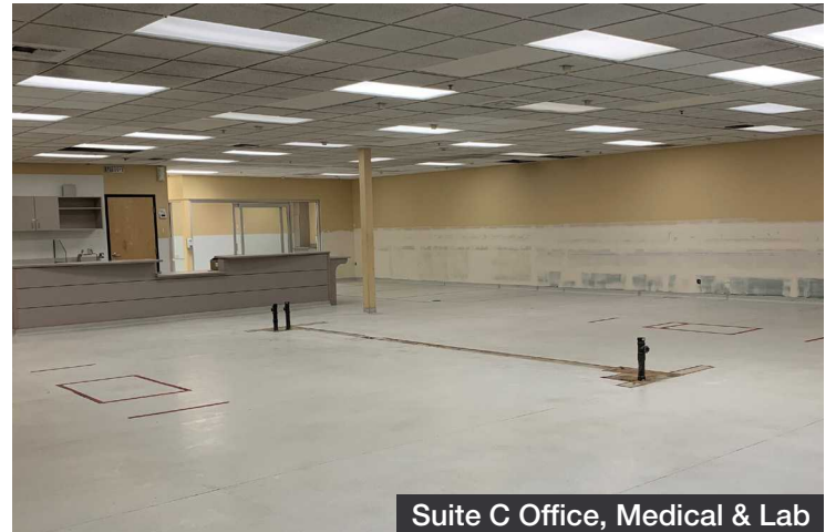
Suite C Office, Medical & Lab