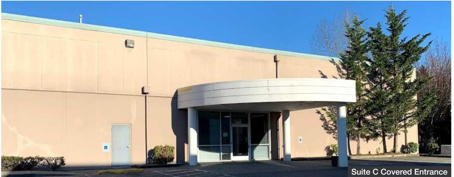
Suite C Covered Entrance