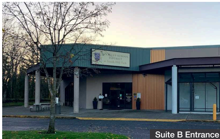
Suite B Entrance