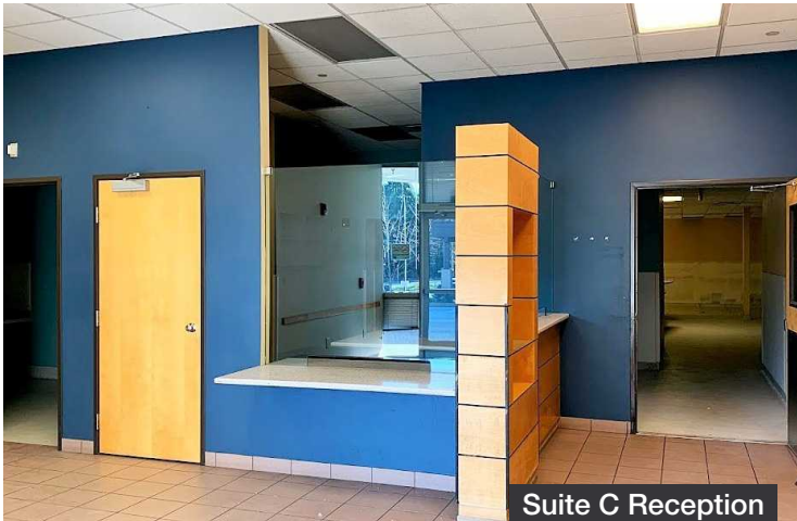
Suite C Reception