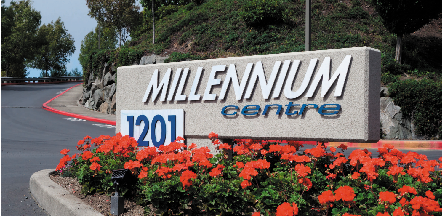
BUILDING DRIVEWAY FROM MONSTER ROAD SW