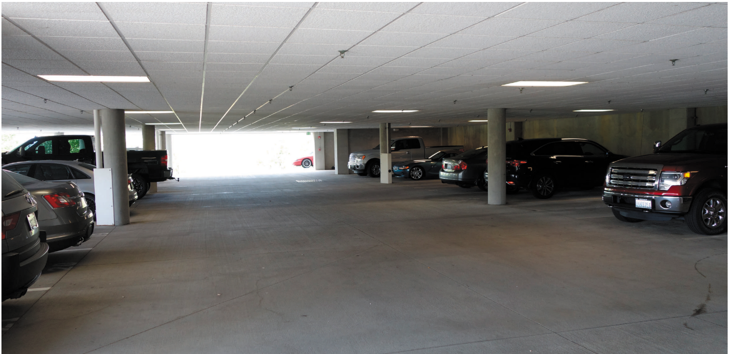
COVERED AND RESERVED PARKING AVAILABLE