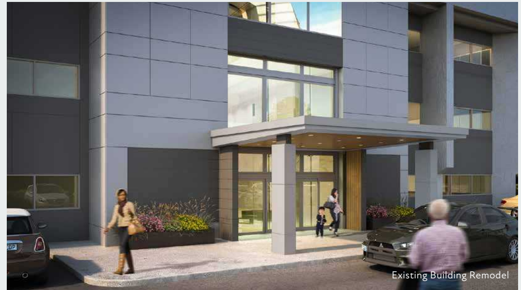
Existing Building Remodel

The Tacoma Medical Center is a Class A medical office building in an unbeatable Tacoma location