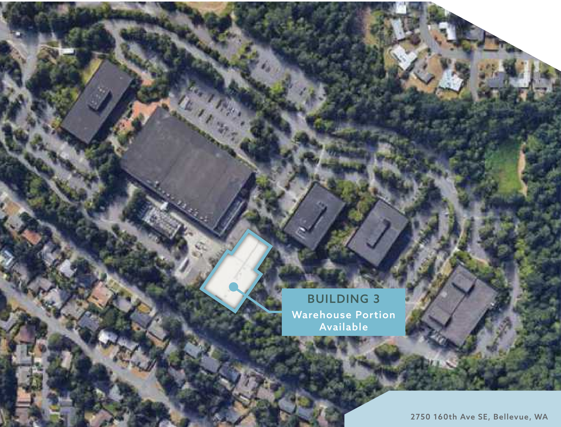
BUILDING 3 Warehouse Portion Available