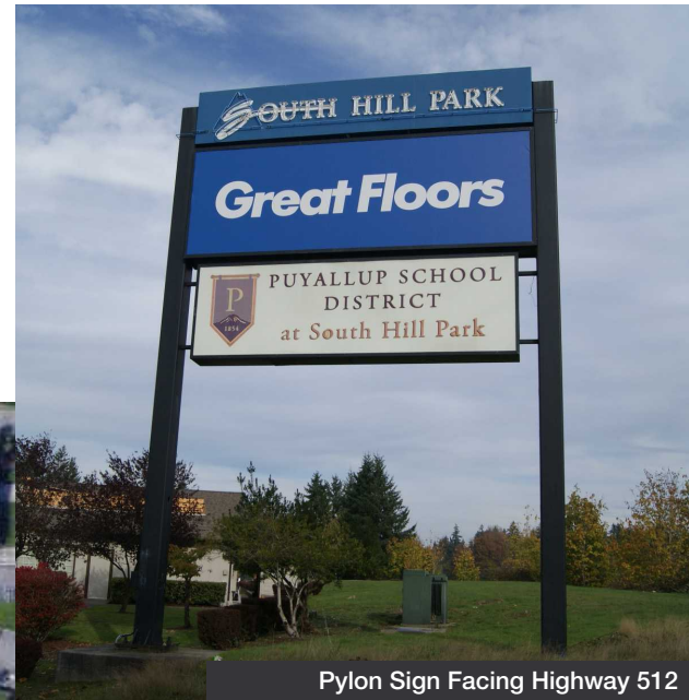
Pylon Sign Facing Highway 512