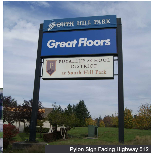
Pylon Sign Facing Highway 512