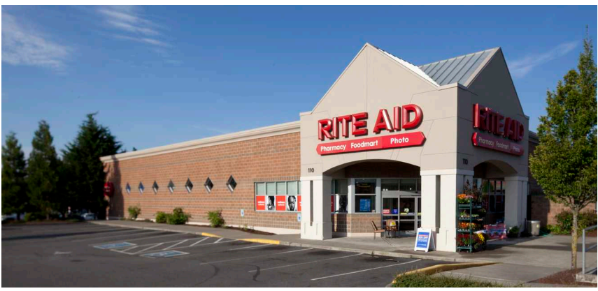
A Powell Development Property - www.powelldev.com