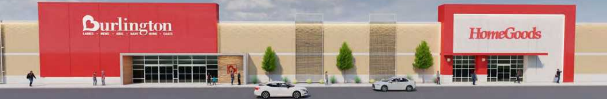
Walla Walla Town Center's newest tenants adjacent to the available Former Shopko Building