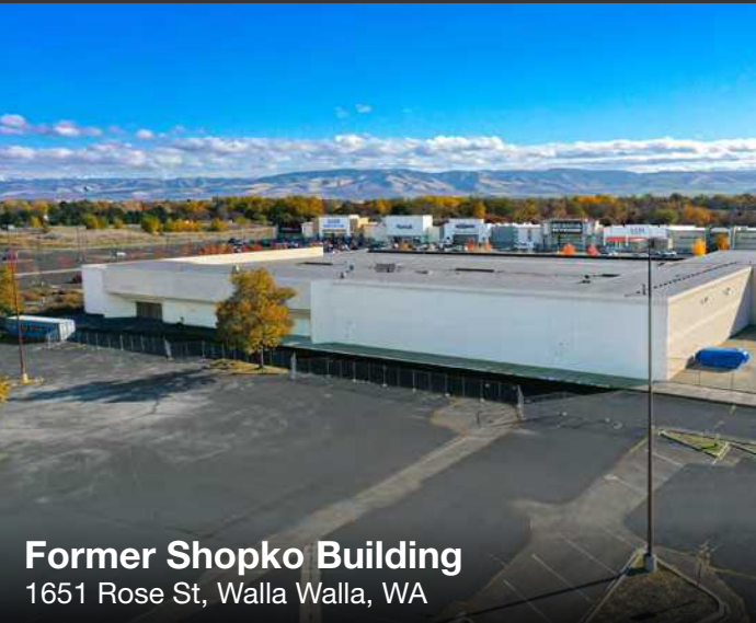
Former Shopko Building 1651 Rose St, Walla Walla, WA