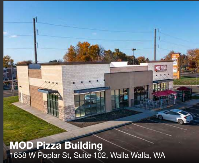
MOD Pizza Building 1658 W Poplar St, Suite 102, Walla Walla, WA