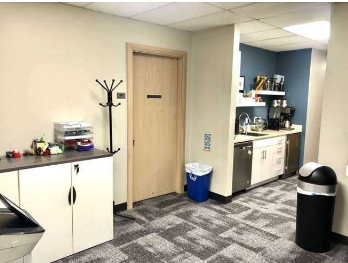
Suite 200 Kitchenette