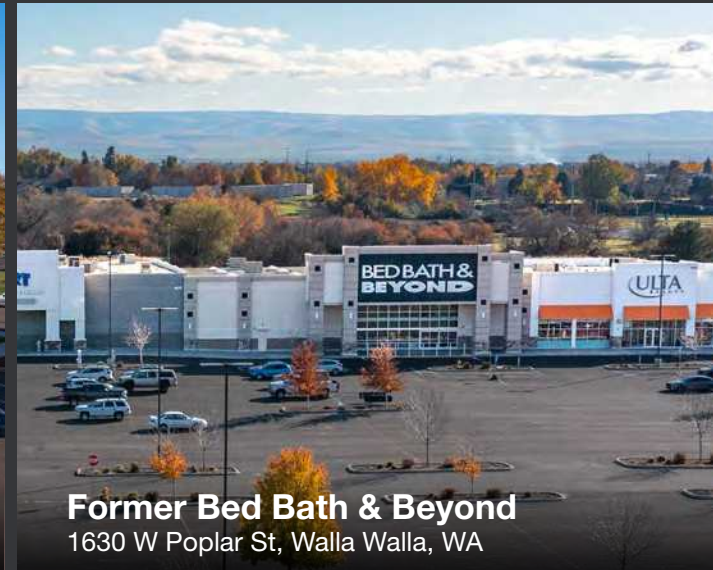
Former Bed Bath & Beyond 1630 W Poplar St, Walla Walla, WA

SIZE 38,000 SF LEASE RATE Call broker for rates