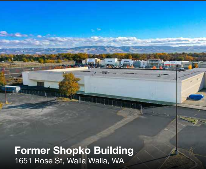
Former Shopko Building 1651 Rose St, Walla Walla, WA