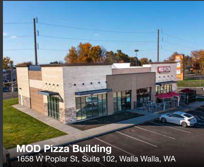
MOD Pizza Building 1658 W Poplar St, Suite 102, Walla Walla, WA