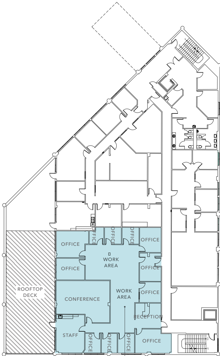
SUITE 301 4,699 SF