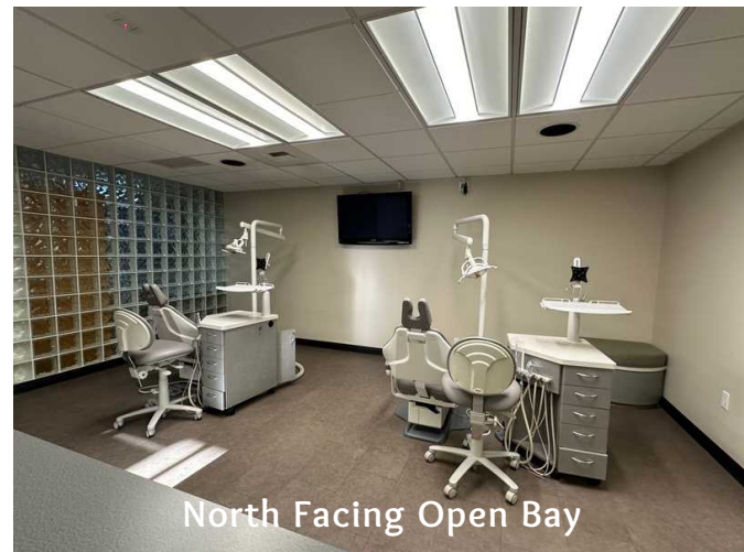
North Facing Open Bay

✉ Sage Newman sage.newman@lacmontrealty.com