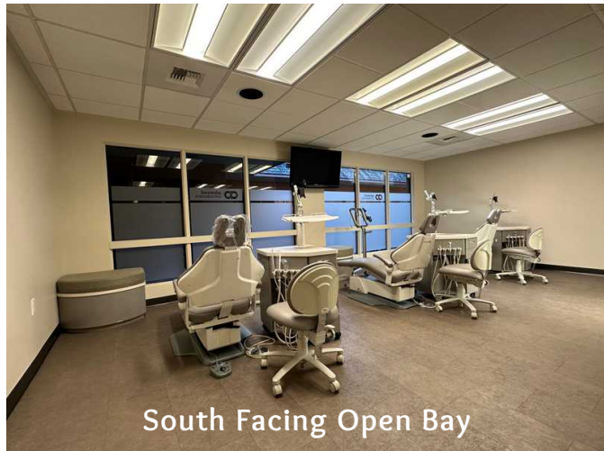
South Facing Open Bay