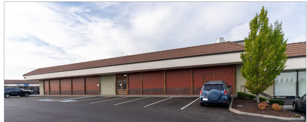
Building A (3630)