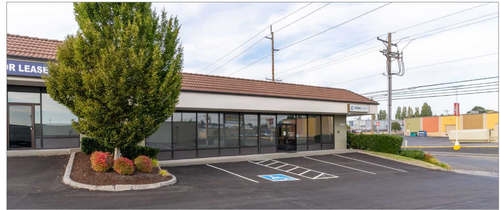
Building A (3630)