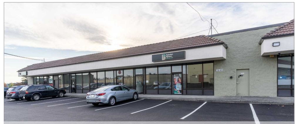
Building D - Top Level (3640)

The information provided herein has been obtained from sources believed to be reliable, but no representation or warranty, express or implied, is made with respect to the accuracy or completeness of any such information. Each prospective buyer or tenant should independently investigate, evaluate and verify all information provided herein and any other matters deemed material. Please consult your attorney, tax advisor or other professional advisor. The terms of sale or lease set forth herein are subject to change or withdrawal at any time and without notice.