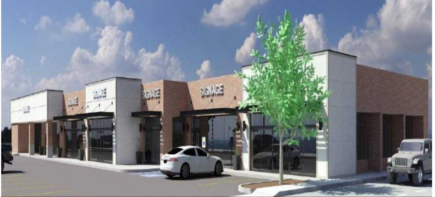
Option 1 - N Francis Avenue Retail Rendering