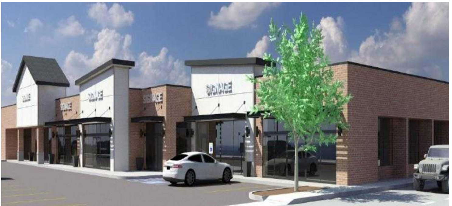
Option 2 - N Francis Avenue Retail Rendering