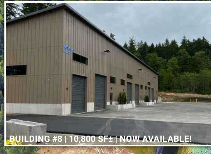
BUILDING #8 | 10,800 SF± | NOW AVAILABLE!