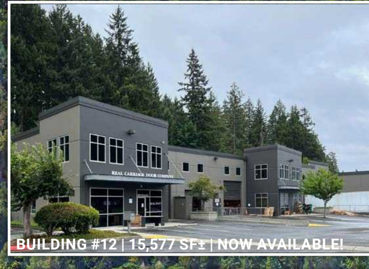
BUILDING #12 | 15,577 SF± | NOW AVAILABLE!

9808 44th Avenue NW Gig Harbor, WA 98332