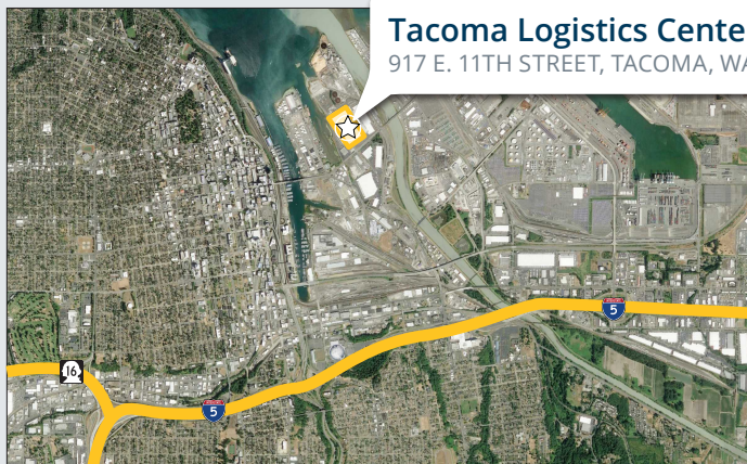
Tacoma Logistics Center 917 E. 11TH STREET, TACOMA, WA