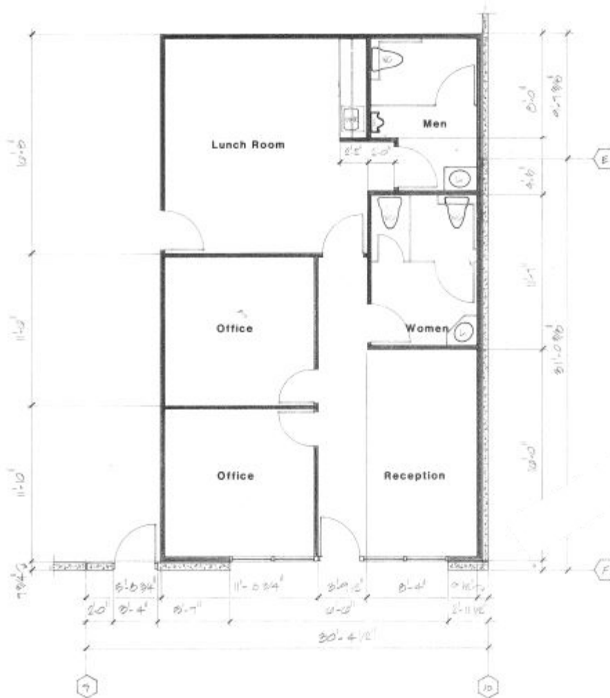
OFFICE FLOOR PLAN