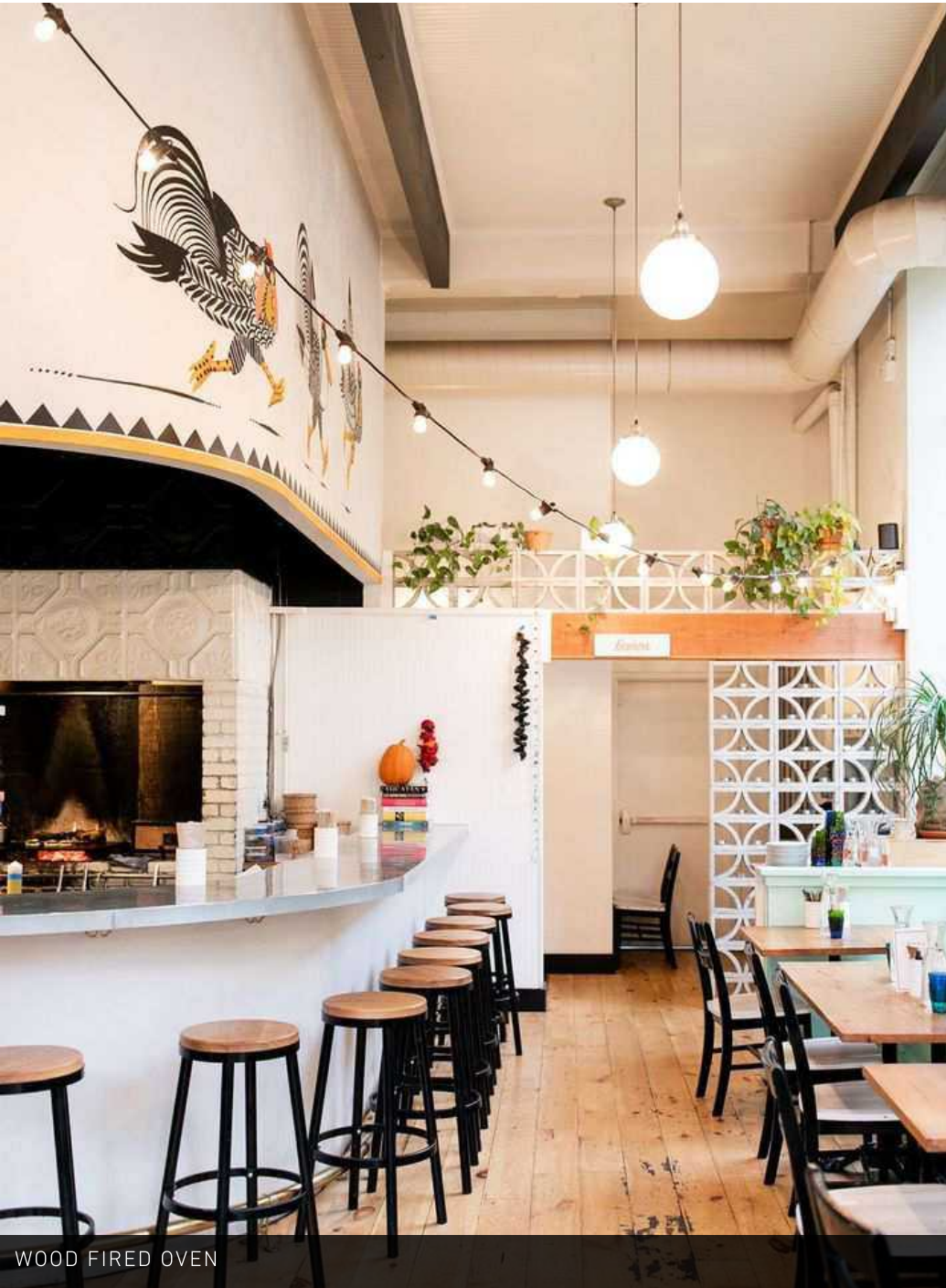
WOOD FIRED OVEN