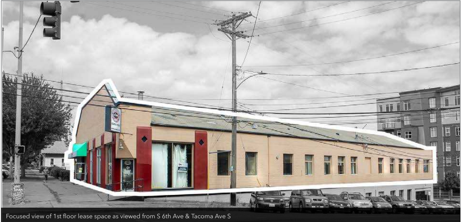
Focused view of 1st floor lease space as viewed from S 6th Ave & Tacoma Ave S

LEE & ASSOCIATES COMMERCIAL REAL ESTATE SERVICES