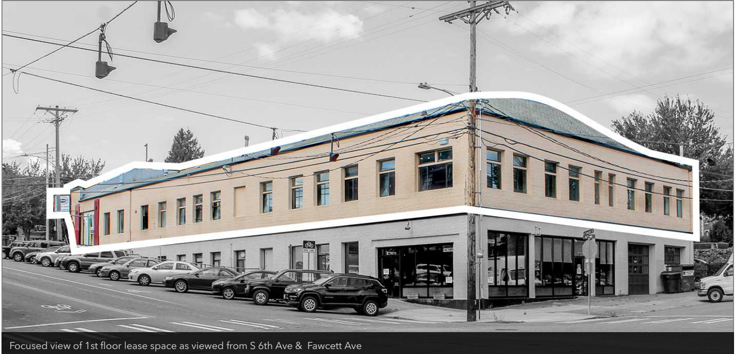
Focused view of 1st floor lease space as viewed from S 6th Ave & Fawcett Ave