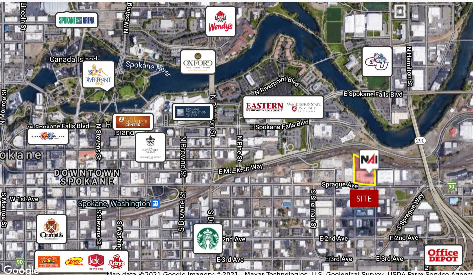
Map data © 2021 Google Imagery © 2021, Maxar Technologies, U.S. Geological Survey, USDA Farm Service Agency