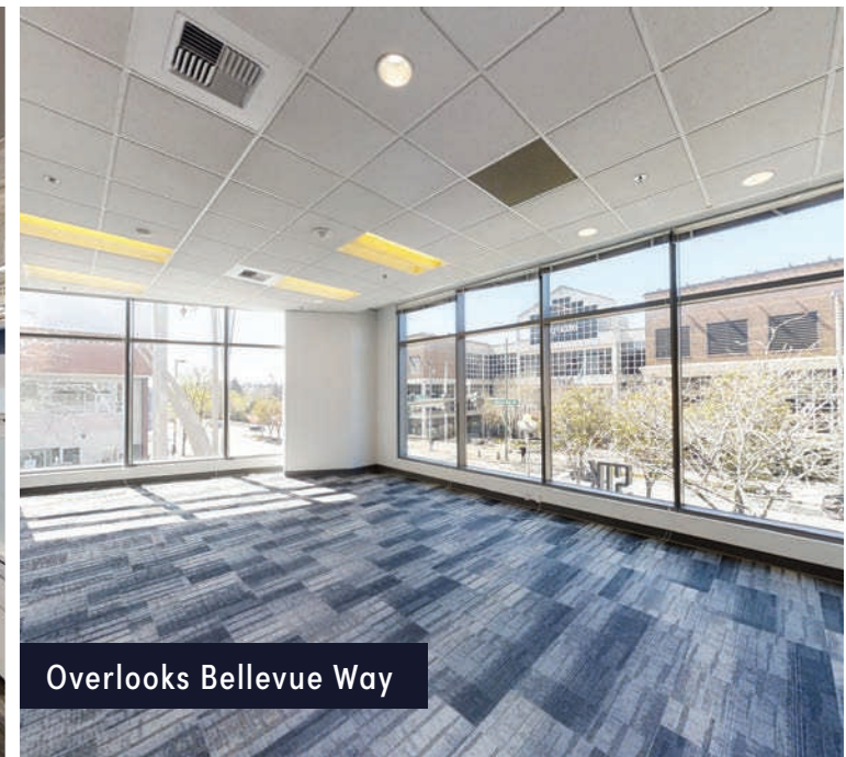
Overlooks Bellevue Way