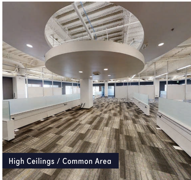
High Ceilings / Common Area