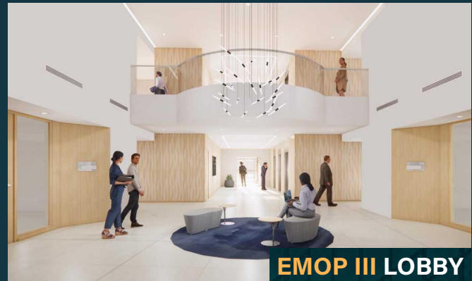
EMOP III LOBBY