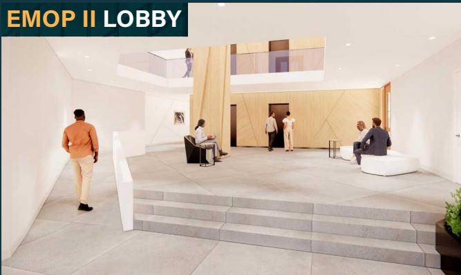
EMOP II LOBBY