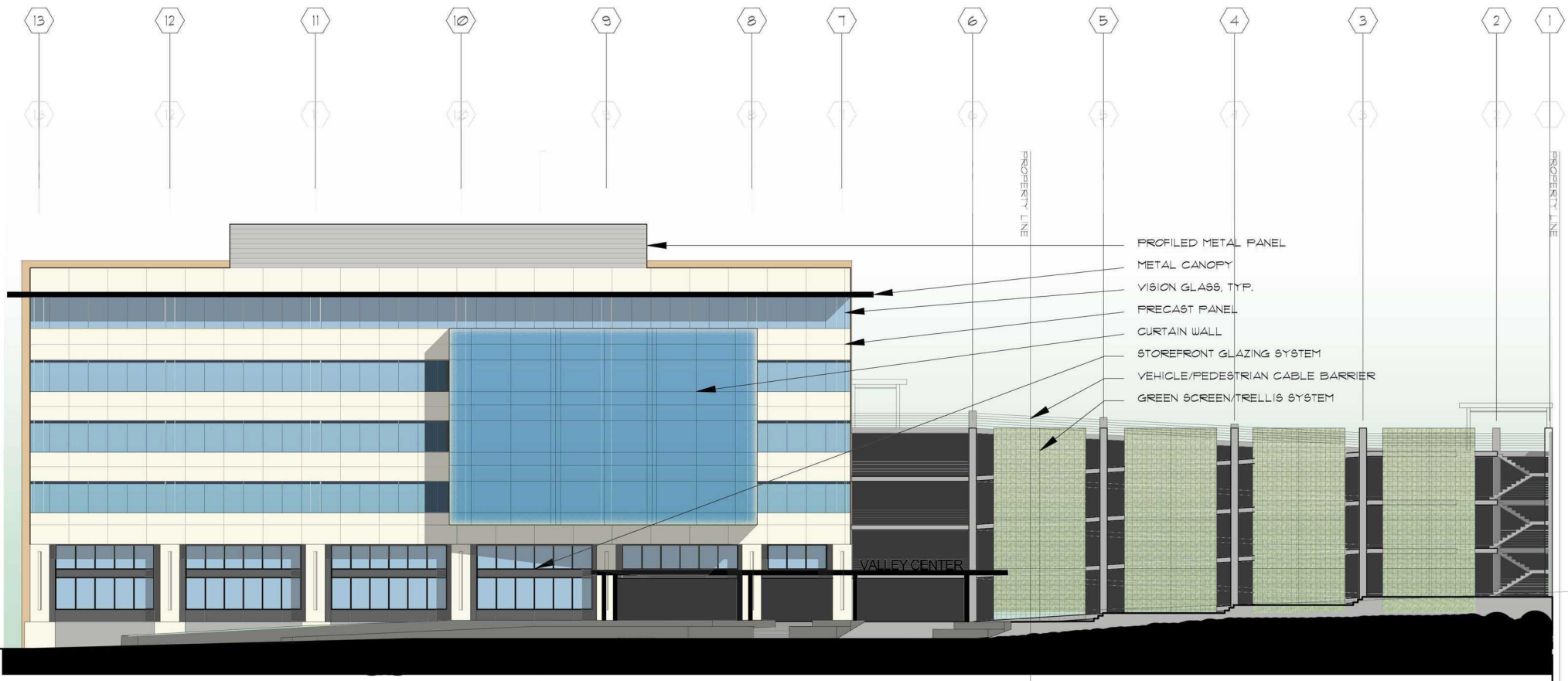
W WEST ELEVATION SCALE: 3/32" = 1'-0"