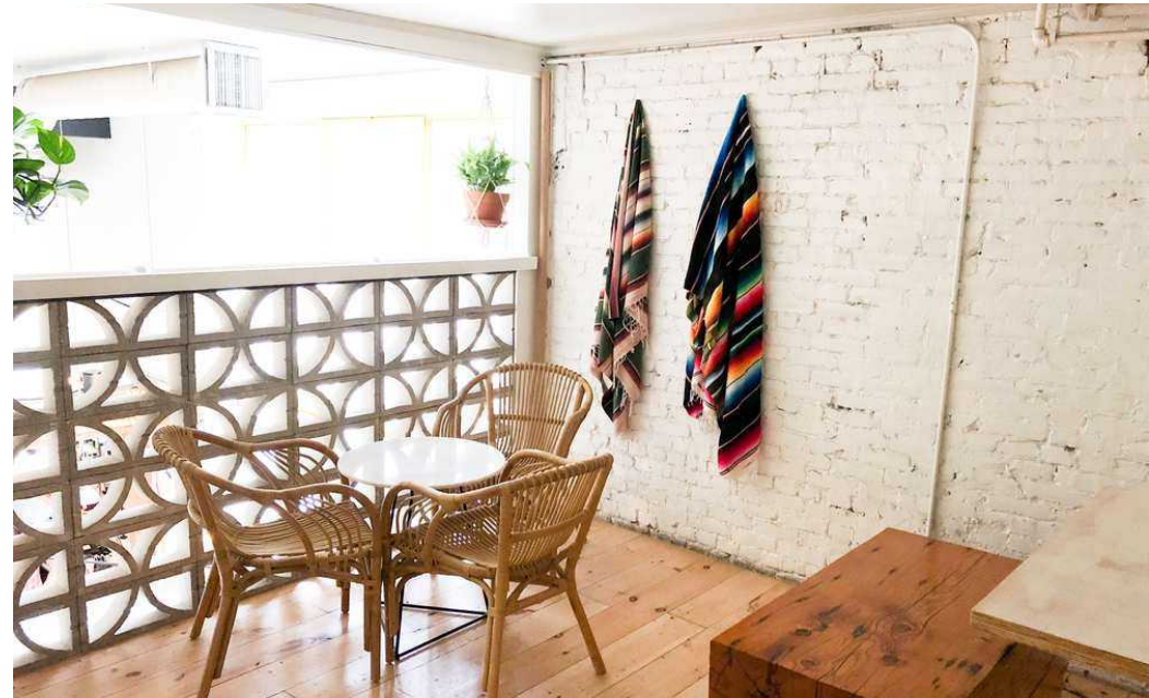
MEZZANINE/PRIVATE DINING/EVENT SPACE