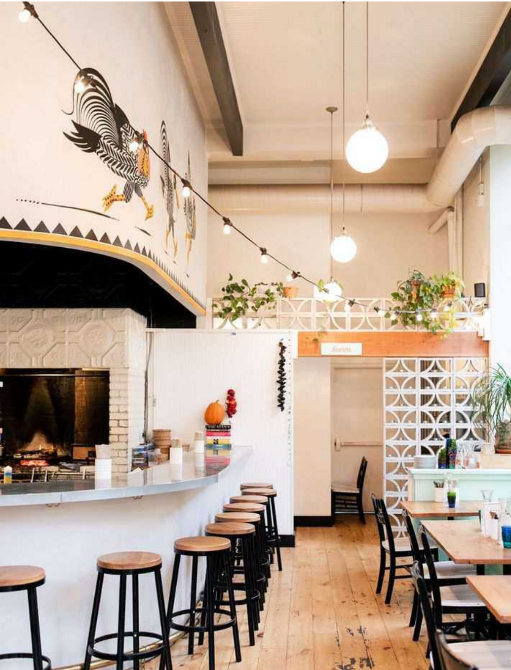
WOOD FIRED OVEN