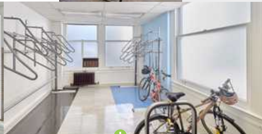
+ Convenient bike access and storage for two-wheeled commuters