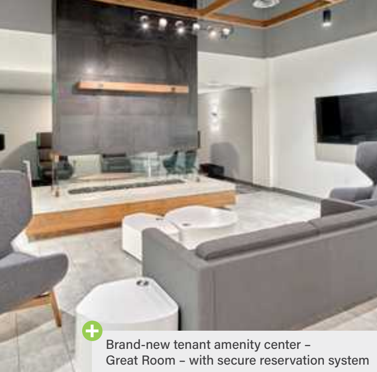
+ Brand-new tenant amenity center – Great Room – with secure reservation system