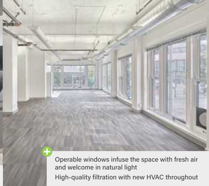
+ Operable windows infuse the space with fresh air and welcome in natural light High-quality filtration with new HVAC throughout