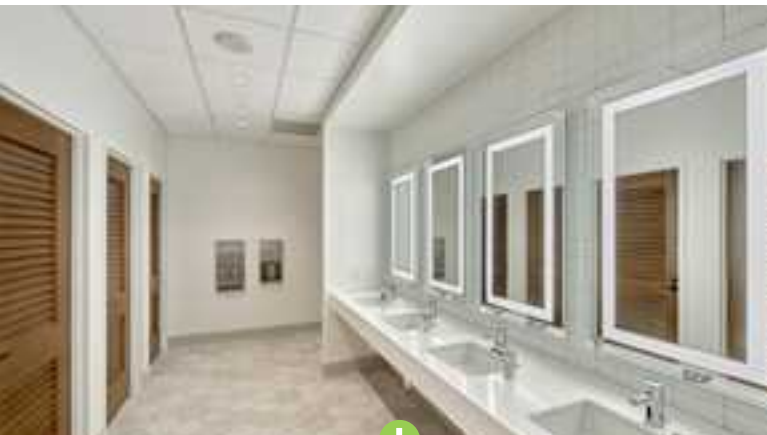
+ Fully renovated bathrooms, locker rooms and showers