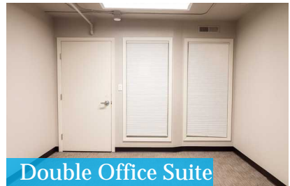
Double Office Suite

Crown Plaza has finished the last of the renovations, including a new elevator. Crown Plaza will be the most modern historic building Downtown. Your clients will enjoy all the character with none of the hassles that older buildings typically have. These coming months are an excellent time to give your clients an opportunity for great lease rates AND a beautifully renovated building to enjoy for years to come!