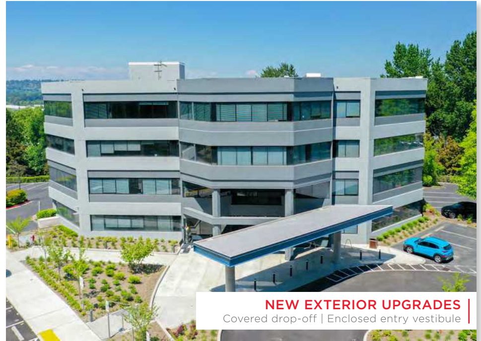
NEW EXTERIOR UPGRADES Covered drop-off | Enclosed entry vestibule

Future MOB Proposed 42K SF development adjacent to site