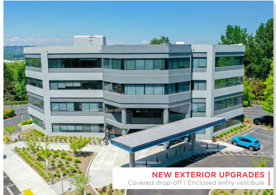
NEW EXTERIOR UPGRADES Covered drop-off | Enclosed entry vestibule

Future MOB Proposed 42K SF development adjacent to site