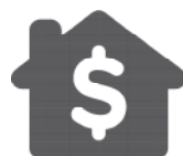
Average HH Income