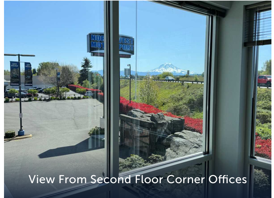
View From Second Floor Corner Offices