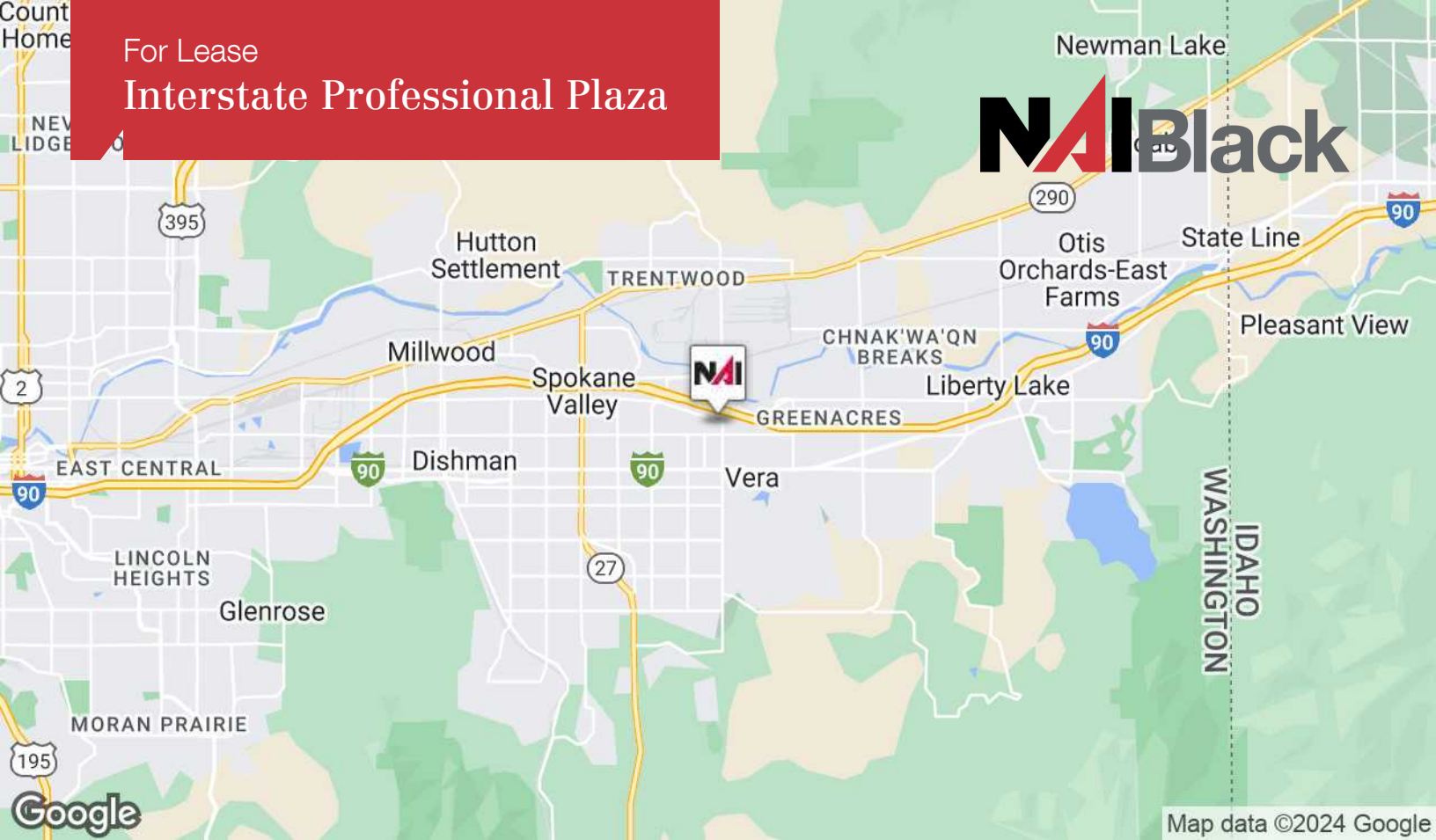
Map data ©2024 Google