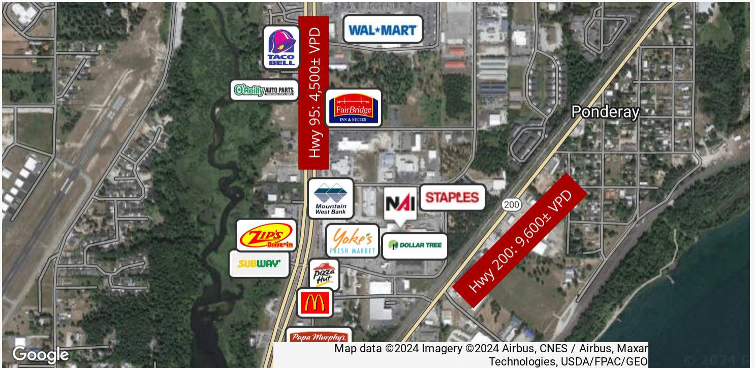
Map data ©2024 Imagery ©2024 Airbus, CNES / Airbus, Maxar Technologies, USDA/FPAC/GEO