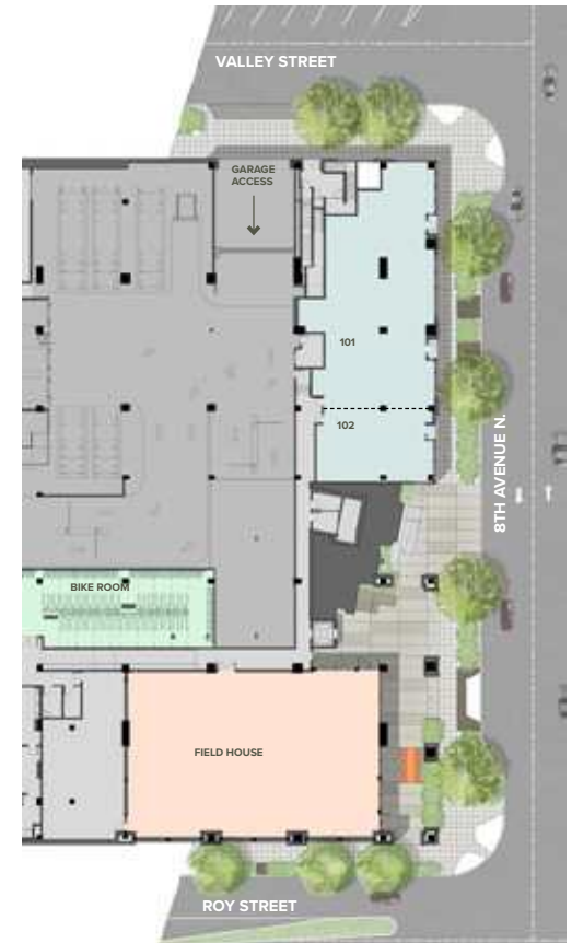
LOWER LEVEL PLAN

P BUILDING GARAGE ELEVATOR R COMMON AREA RESTROOM