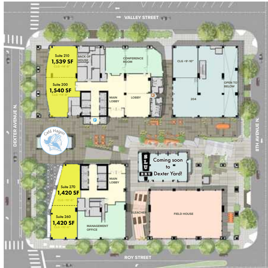
MAIN LEVEL PLAN

Suite 270: 1,420 SF AVAILABLE Suite 260: 1,420 SF AVAILABLE can combine 2,840 SF