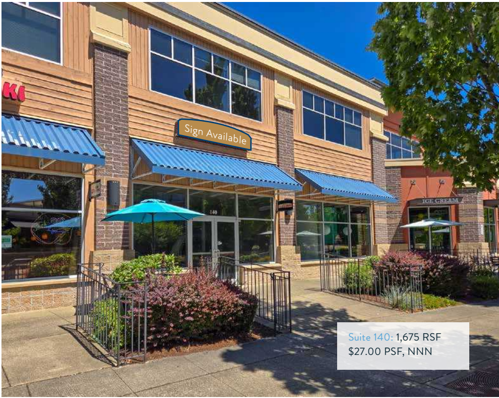
Suite 140: 1,675 RSF $27.00 PSF, NNN