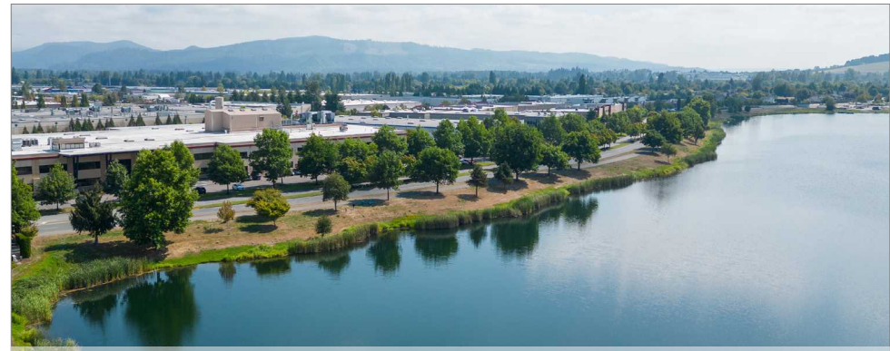
Lake Tye & Lake Tye Trail