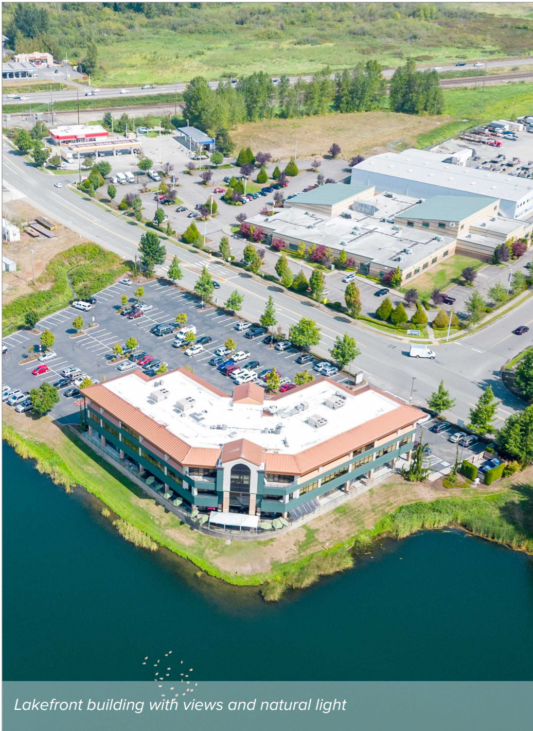
Lakefront building with views and natural light