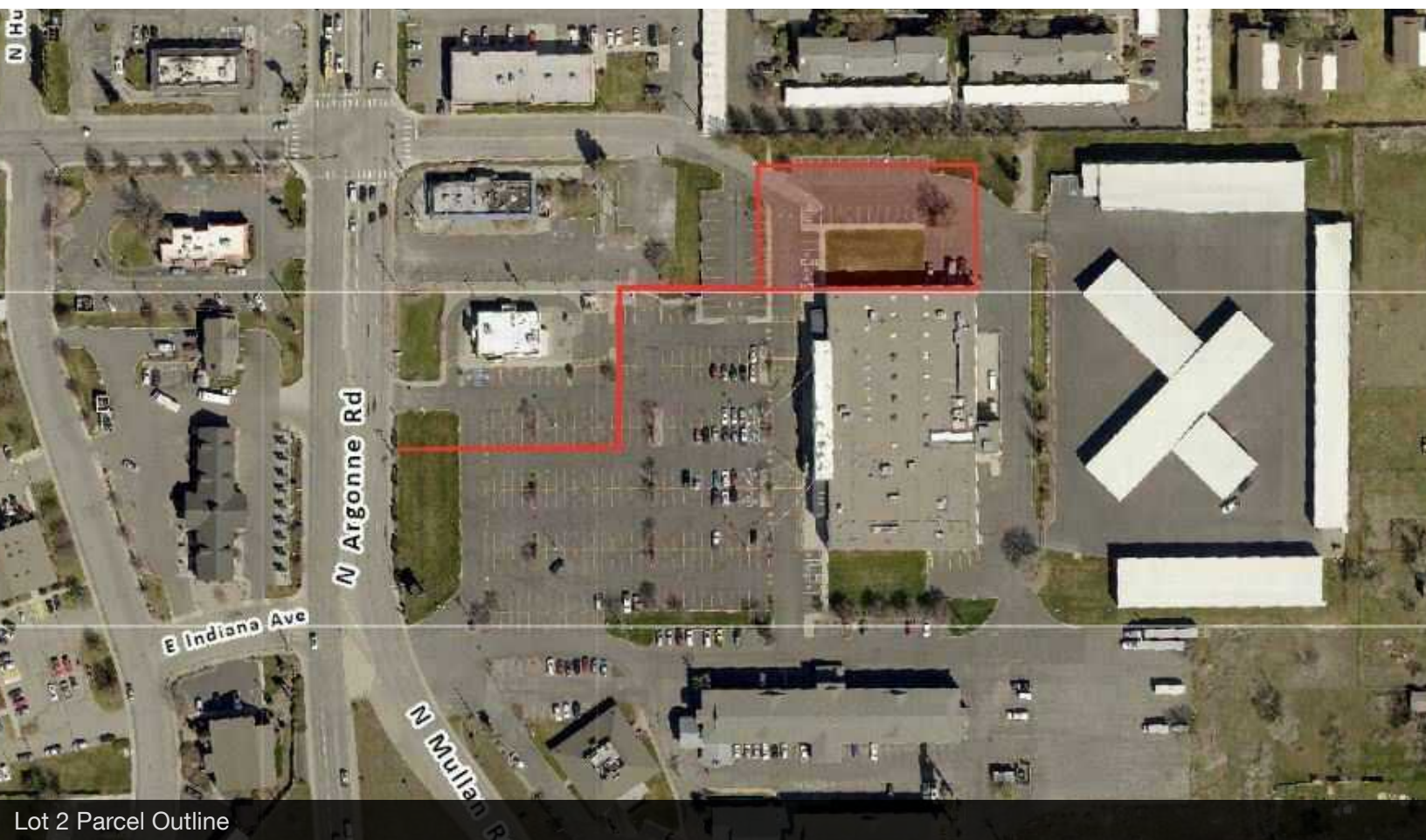
Lot 2 Parcel Outline