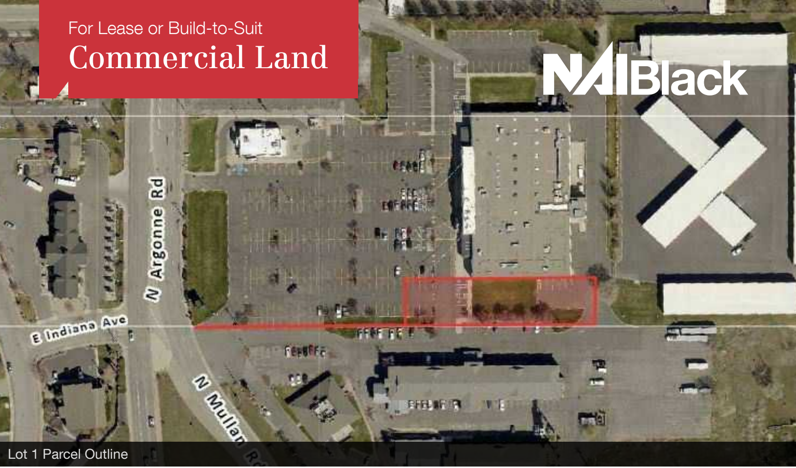
Lot 1 Parcel Outline