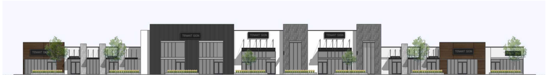
Alameda Retail Concept - Pocatello, ID methodstudio