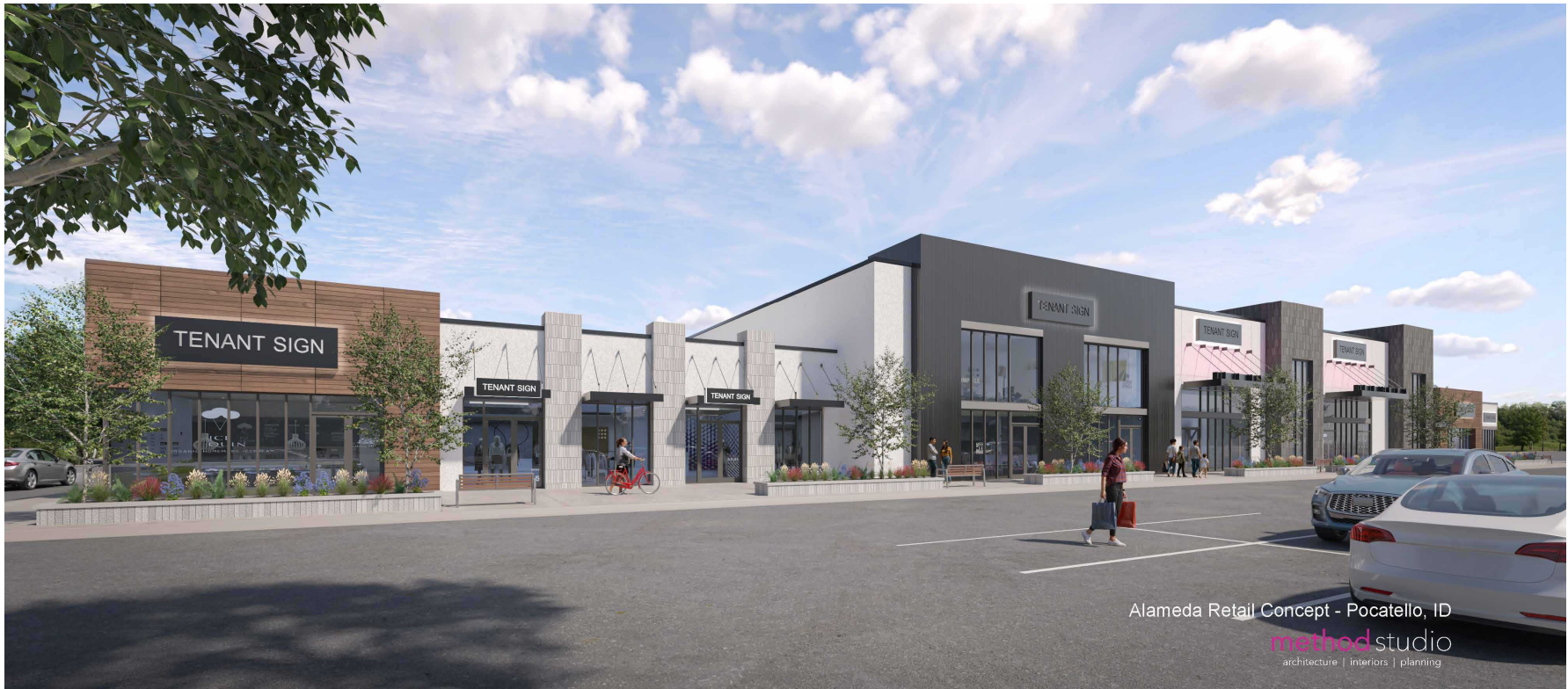
Alameda Retail Concept - Pocatello, ID methodstudio architecture | interiors | planning