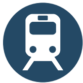
Two blocks to Bellevue Transit Center and East Link Light Rail Station