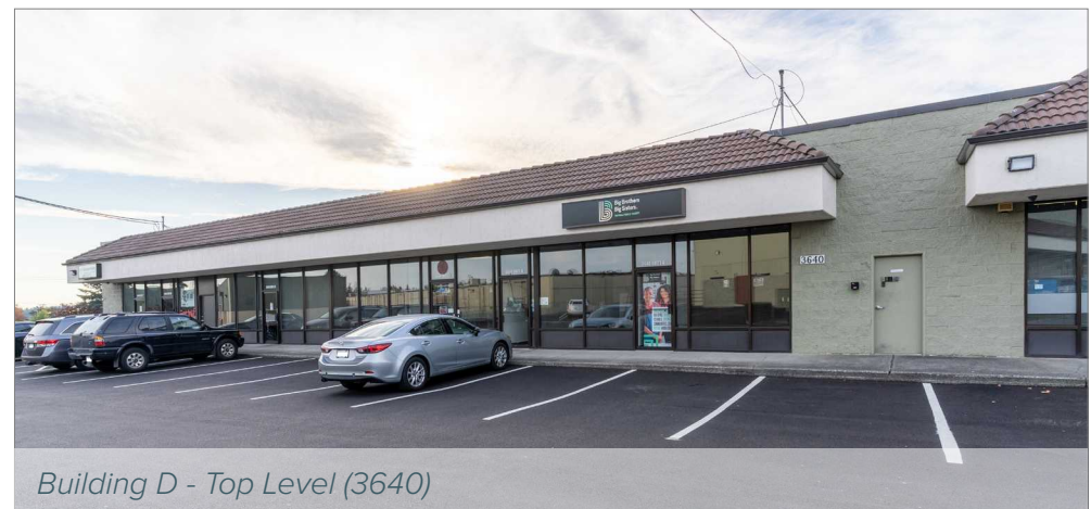
Building D - Top Level (3640)

The information provided herein has been obtained from sources believed to be reliable, but no representation or warranty, express or implied, is made with respect to the accuracy or completeness of any such information. Each prospective buyer or tenant should independently investigate, evaluate and verify all information provided herein and any other matters deemed material. Please consult your attorney, tax advisor or other professional advisor. The terms of sale or lease set forth herein are subject to change or withdrawal at any time and without notice.