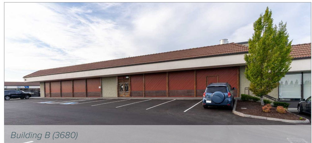
Building B (3680)