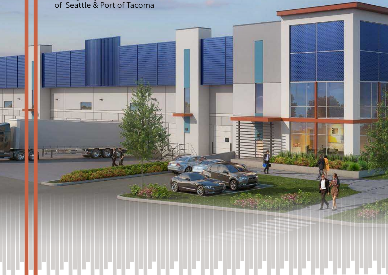
Construction Update September 2024

Strategically located between the Port of Seattle & Port of Tacoma