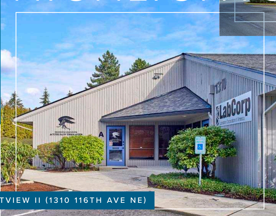
EASTVIEW II (1310 116TH AVE NE)