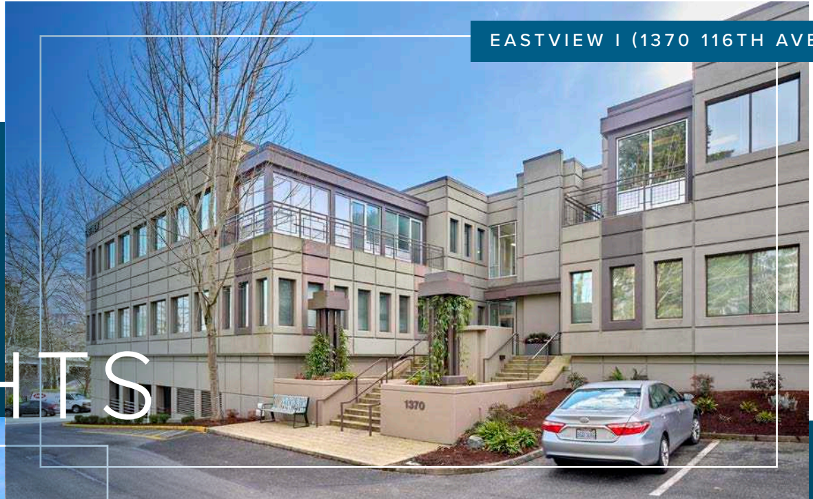
EASTVIEW I (1370 116TH AVE NE)